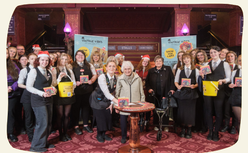
The Edinburgh Playhouse Charity of the Year 2023/2024.

Good Luck! You are our SUPERHEROES and we know you can do it!